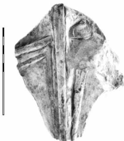
Figure 13 (Veldmeijer, 2002: figure 6). Partial front extremities (SMNS 80437); family, genus and species indet. Scale bar in cm.