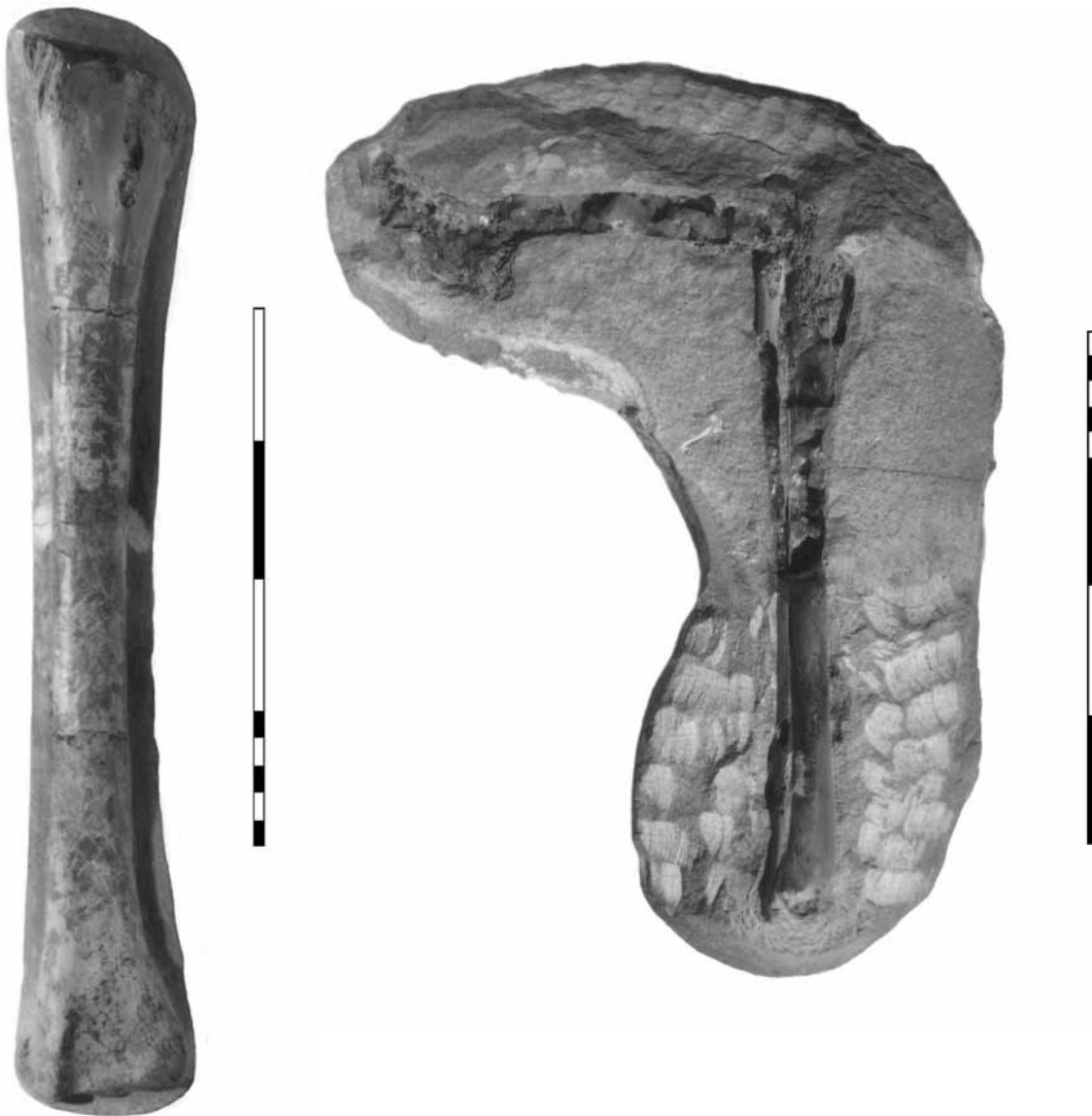
Figure 9 (left, Veldmeijer, 2002: figure 3C). Ulna of cf. Coloborhynchus spielbergi Veldmeijer, 2003 (SMNS 55413). Scale bar in cm.