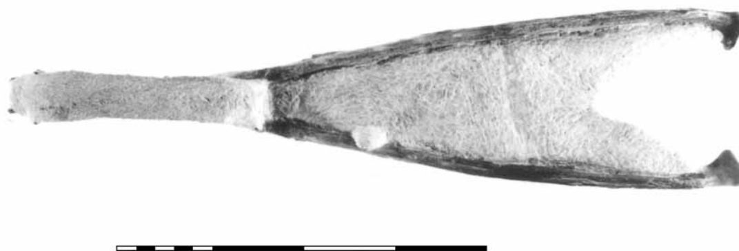
Figure 1. (Veldmeijer, 2002: figure 1, plate 1). Dorsal aspect of the mandible of cf. Criorhynchus mesembrinus (Wellnhofer, 1985) (SMNS 56994). Scale bar in cm.