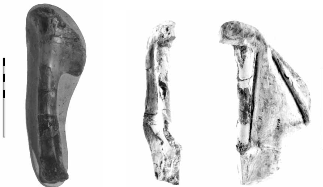
Figure 2 (left, Veldmeijer, 2002: figure 2A). Humerus (SMNS 55407). Scale bar in cm.