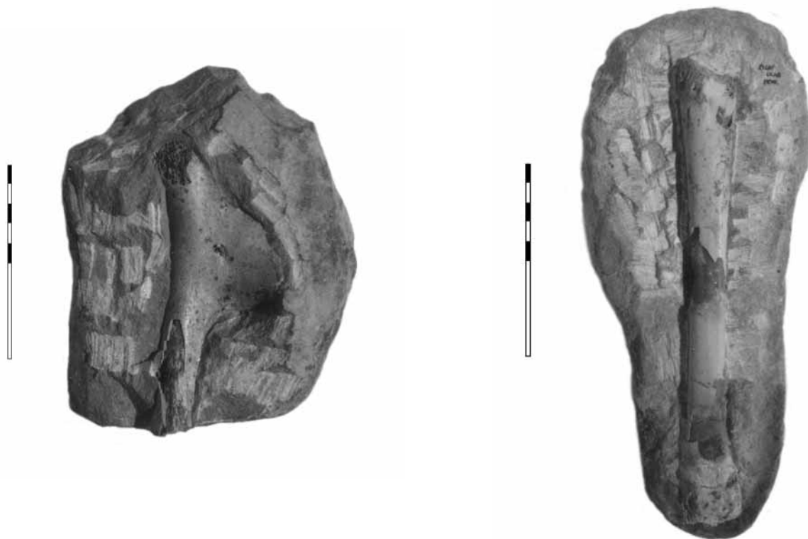
Figure 5 (Veldmeijer, 2002: figure 2D). Humerus cf. Santanadactylus pricei Wellnhofer , 1985 (SMNS 55883). Scale bar in cm.