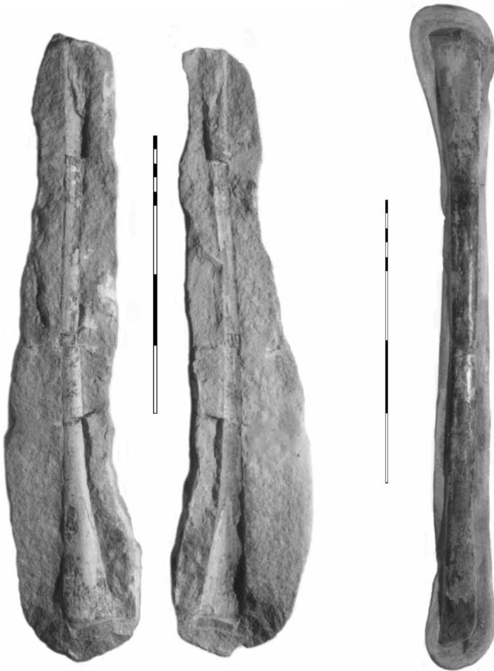
Figure 11 (left; Veldmeijer, 2002: figure 5A). Obverse and reverse of phalanx of the wing finger (SMNS 55412). Scale bar in cm.